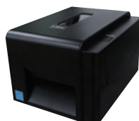
• Label Printer