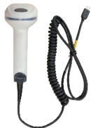
• Barcode Scanner