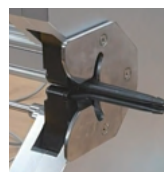
• Grommet Remove Ejector