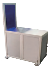
• Working Table