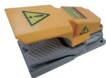
• Foot Switch